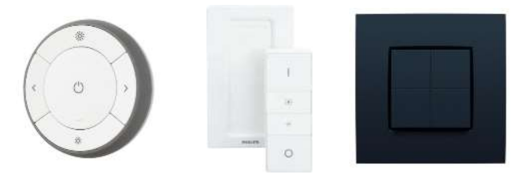
Figure 4. Examples of wireless analog controllers that are connected to the combined network. From left: IKEA TRADFRI remote, Phillips HUE On/Off/Scene select remote with dimmer, Phillips Smart Button with 4 programmable buttons.<sup>4</sup>