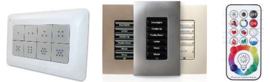
Figure 13. Examples of analog lighting scenes UI controllers – two static, wall mounted, and an infrared remote (on the right).

Scenes - as mentioned briefly above, modern systems also offer "lighting scenes", which are preprogrammed settings of one or more parameters described above, that can be called with a single click of a button or tap on the screen. Scene selection is made to save time and increase comfort of the user, especially if there is so many parameters to determine – in order to avoid doing it each time while turning on the lighting. For the professionals within industries relying on lighting (designers etc.) using lighting scenes (and saving them) is very beneficial as it secures that certain products are viewed in same light conditions. Furthermore, manufacturers start to propose pre-defined scenes to give ideas how to use their products and benefit from all the possible advantages. For example, increased comfort for activities requiring focus by using cool colour temperature and bright scenes, or an energy-saving scene which utilizes daylight sensor or clock for gradual dimming of lighting.