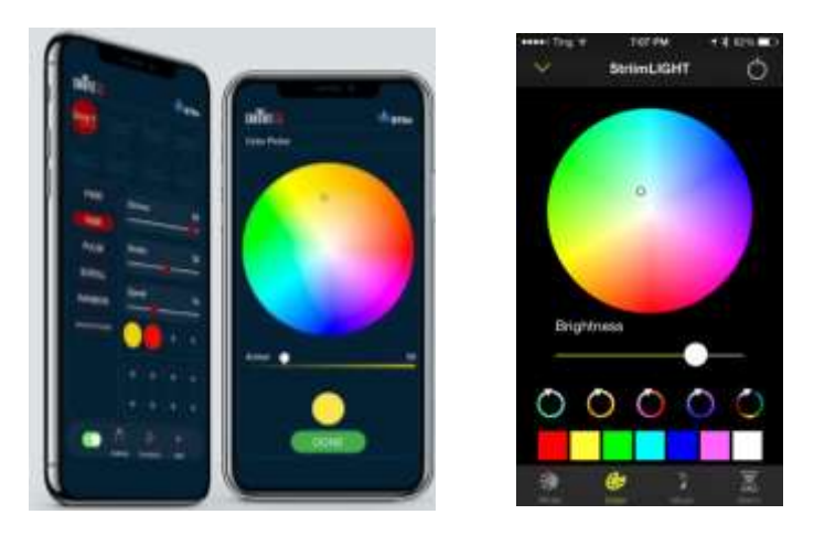
Figure 11. Examples of colour control in User Interface in different lighting control systems applications.<sup>9</sup>

Figure 10. Two analog fixed controls (on the wall) and an infrared remote controller with colour assigned to buttons.