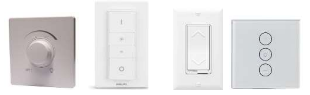
Figure 7. Examples of analog dimmers with different graphics visualizing controls.

The proposed user interface standard uses Brightness as the fundamental concept to be conveyed, with Dimming as just a method to adjust the Brightness Level of a light source.