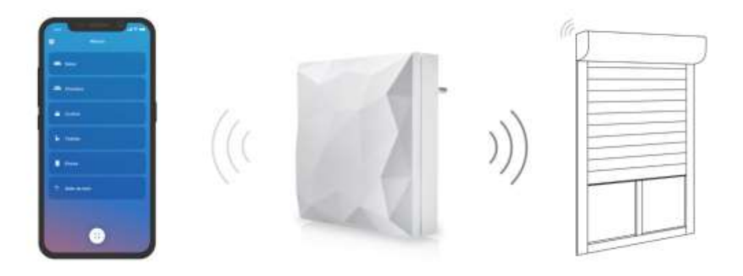
Figure 16. SmartPhone based interfaces by Bubendorff.