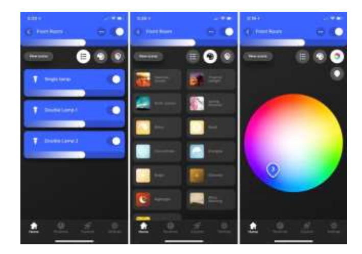
Figure 2. Example of UI: Phillips Hue App interface – from left: 1) different light sources with their intensity shown by slider, and currently set colour 2) Selection of lighting scenes 3) A colour control over lighting in selected room "Front Room".<sup>2</sup>

For the location of the digital controls, beside the portable controls in form of an app on tablet or smartphone, a wall-mounted control panel (screen) is usually placed close to the entrance of a space. In case of combined systems (.2.3.), an ergonomic solution is to have a digital control unit somewhere in center of the house, where it is easily and fast accessible, and combine it with manual switches connected with the system, e.g. at the entrance to the house or other buildings.