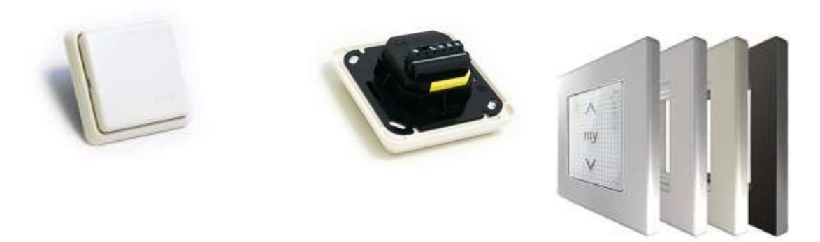
Figure 15. Example of shading switches dedicated to apertures, with possibility to have a master switch controlling the entire installation (open / close)