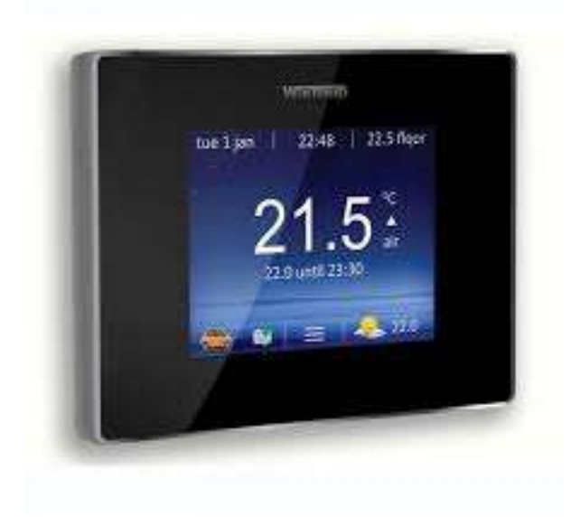
Figure 19. Interface by ONYX