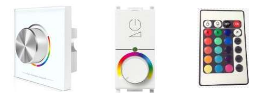
Figure 10. Two analog fixed controls (on the wall) and an infrared remote controller with colour assigned to buttons.

Generally, the user controls the colour through a colour wheel, or buttons with pre-defined colour mixes. In addition, some systems offer numerical representation of intensity of each of the three channels: red, green, and blue, in order to be able to specifically recreate some colours. Colour control is an emerging area of lighting control; how this could be standardized in user interface elements is not yet clear. Note that in Figure 11, the colour palette shown in the last one is rotated and a mirror image of the second one. This is a minor example of the pointless inconsistency found in many lighting controls.