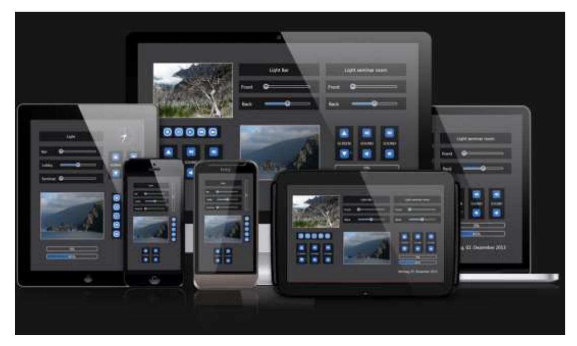
Figure 18. New generation of KNX interfaces.