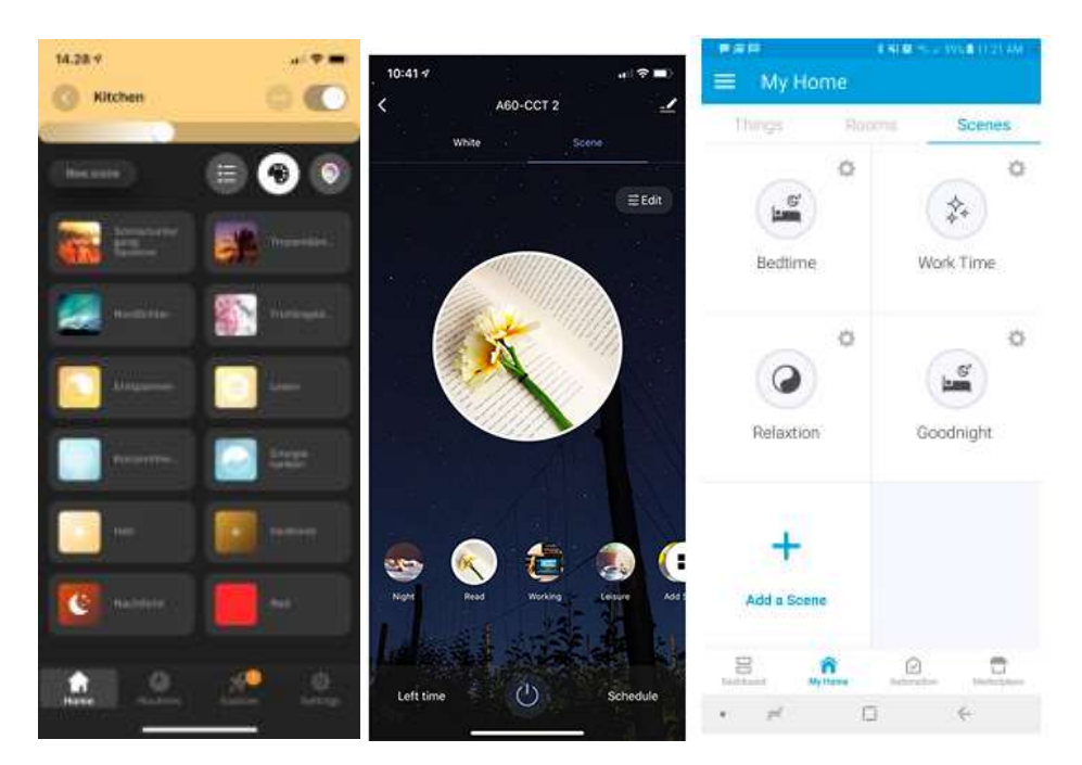
Figure 14. Examples of lighting scenes control in digital UI's.<sup>11</sup>