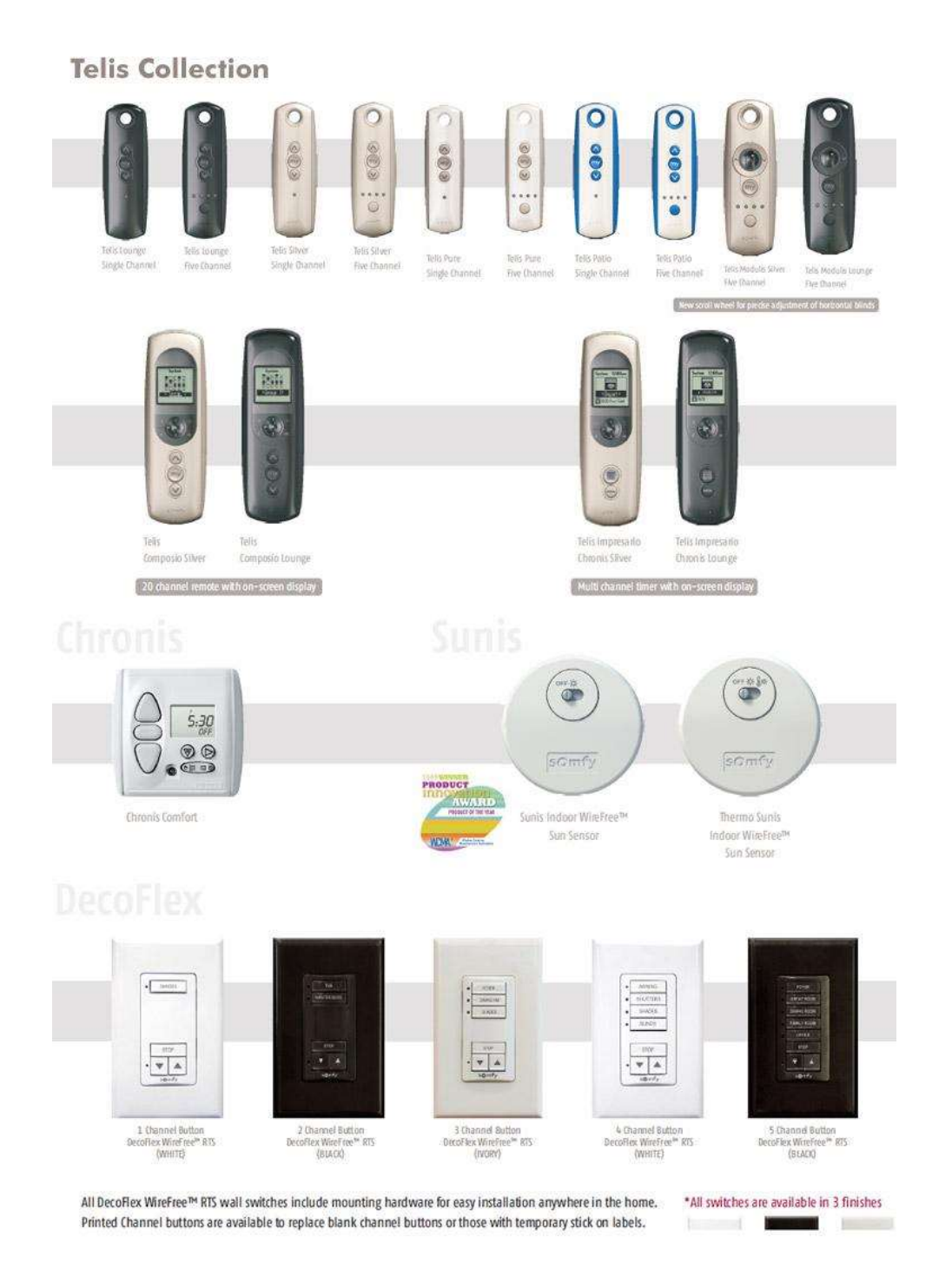
Figure 17. Large development of user interfaces for home shading systems. Wireless and wired interfaces by SOMFY.