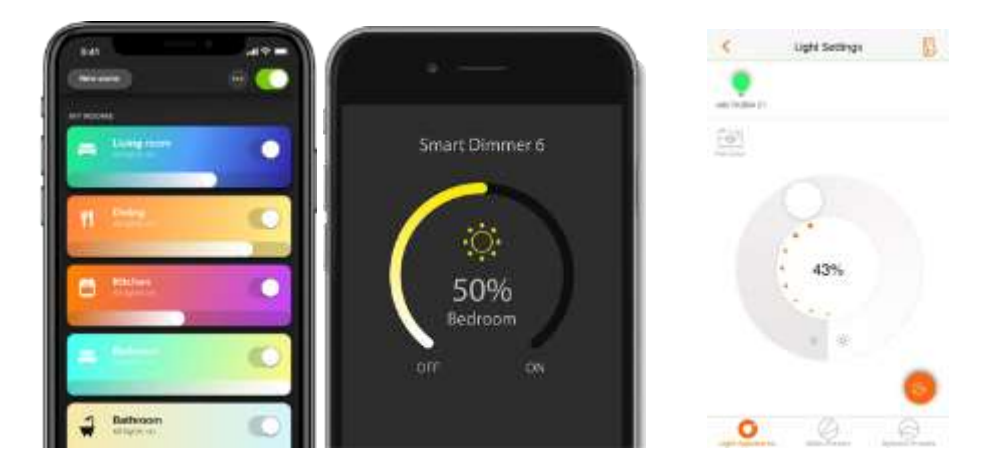
Figure 8. Dimming controls in User Interfaces from different lighting control systems.<sup>7</sup>